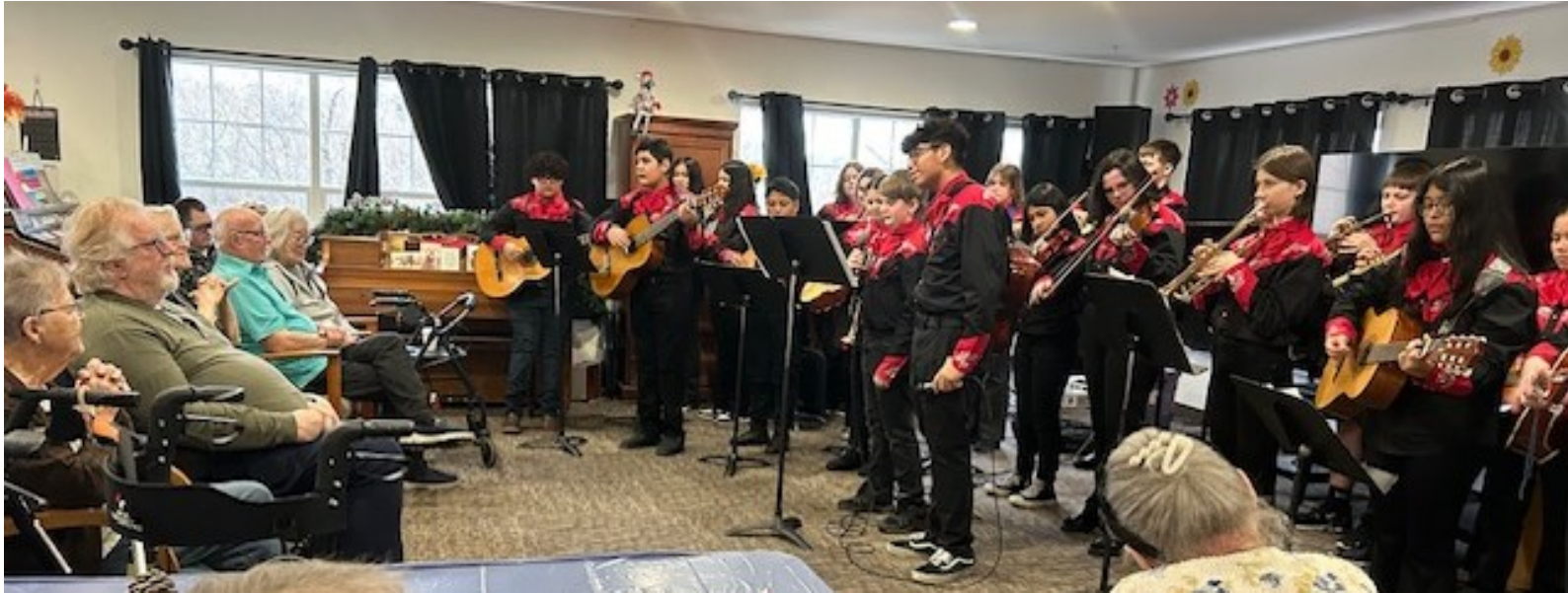
Hilltop Middle School Marichi Band visited from Ilwaco