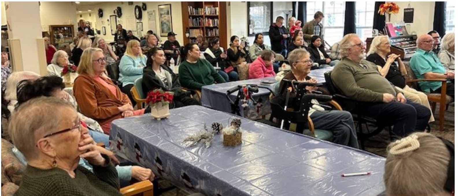
Residents and family members enjoying the Mariachi Band from Ilwaco, Wa.