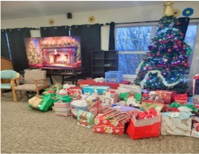
Santa came on Christmas morning and brought gifts for all