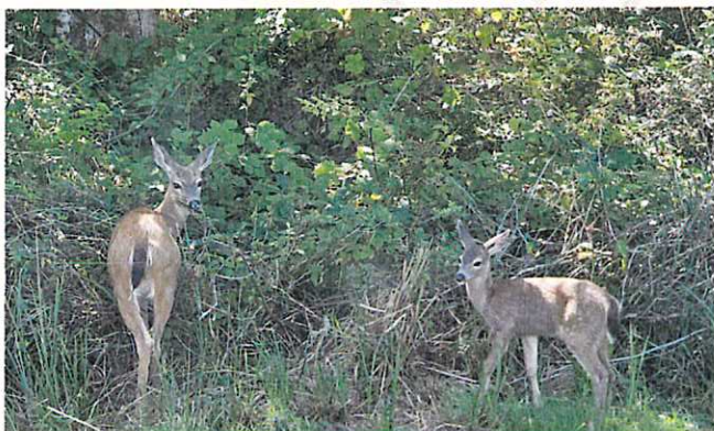
On a bus trip out to Fort Stevens we were lucky to happen upon this mama and baby! It was the highlight of our trip.