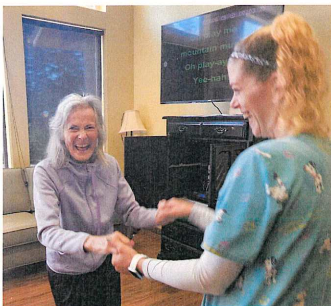
Laughter and Music is good for the soul!